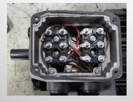
Interior view of terminal box with two terminal blocks